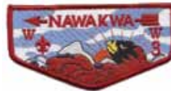
Nawakwa Lodge, Heart of Virginia Council #602 Richmond VA