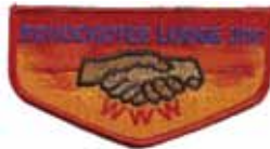
Echockotee Lodge North Florida Council #87 Jacksonville, FL