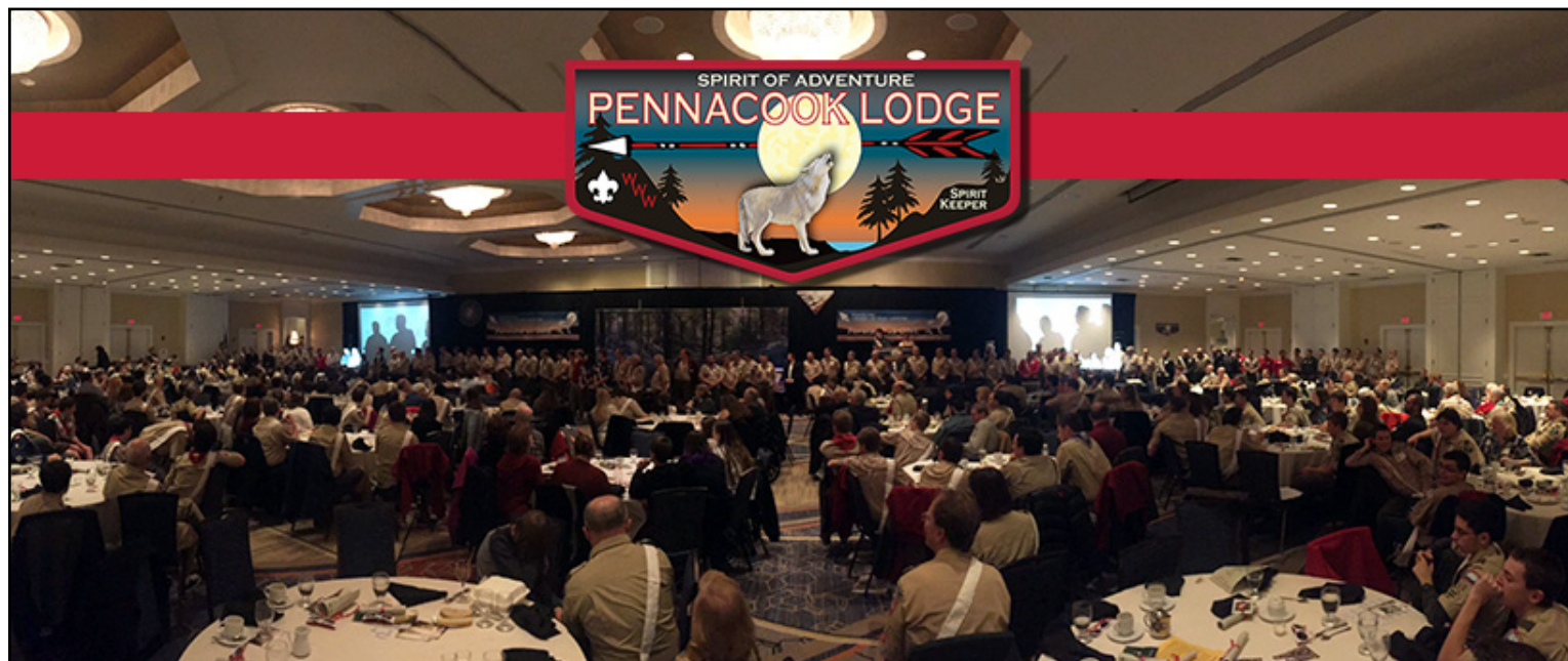
Pennacook Lodge members at their inaugural lodge banquet.