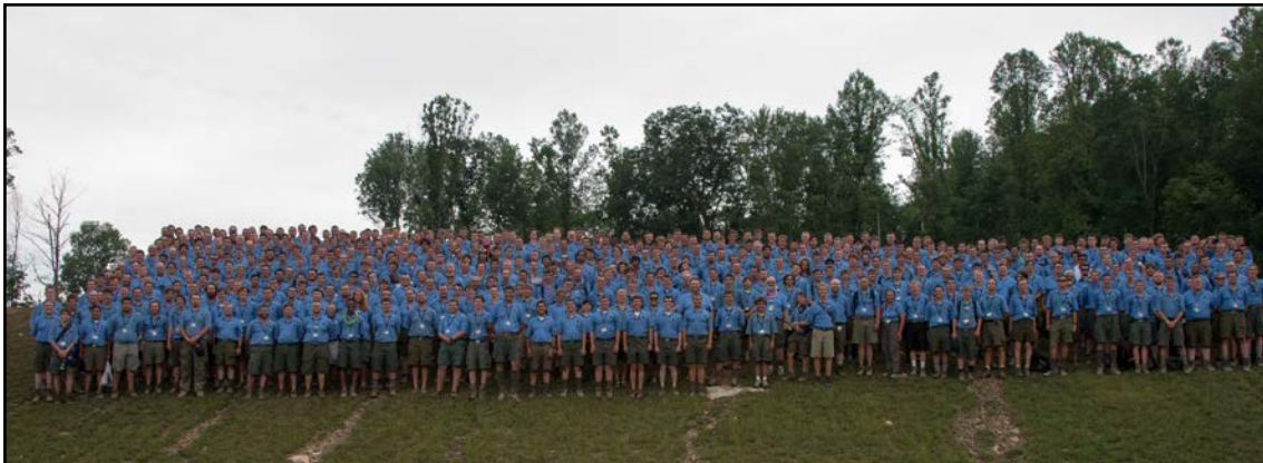
OA staff at the 2013 National Scout Jamboree.