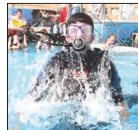
NOAC 2006 collage pages 2+3