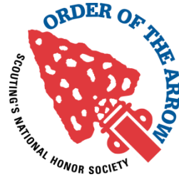
Logo with Tagline