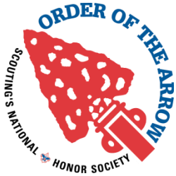
Logo with Tagline and Universal Emblem